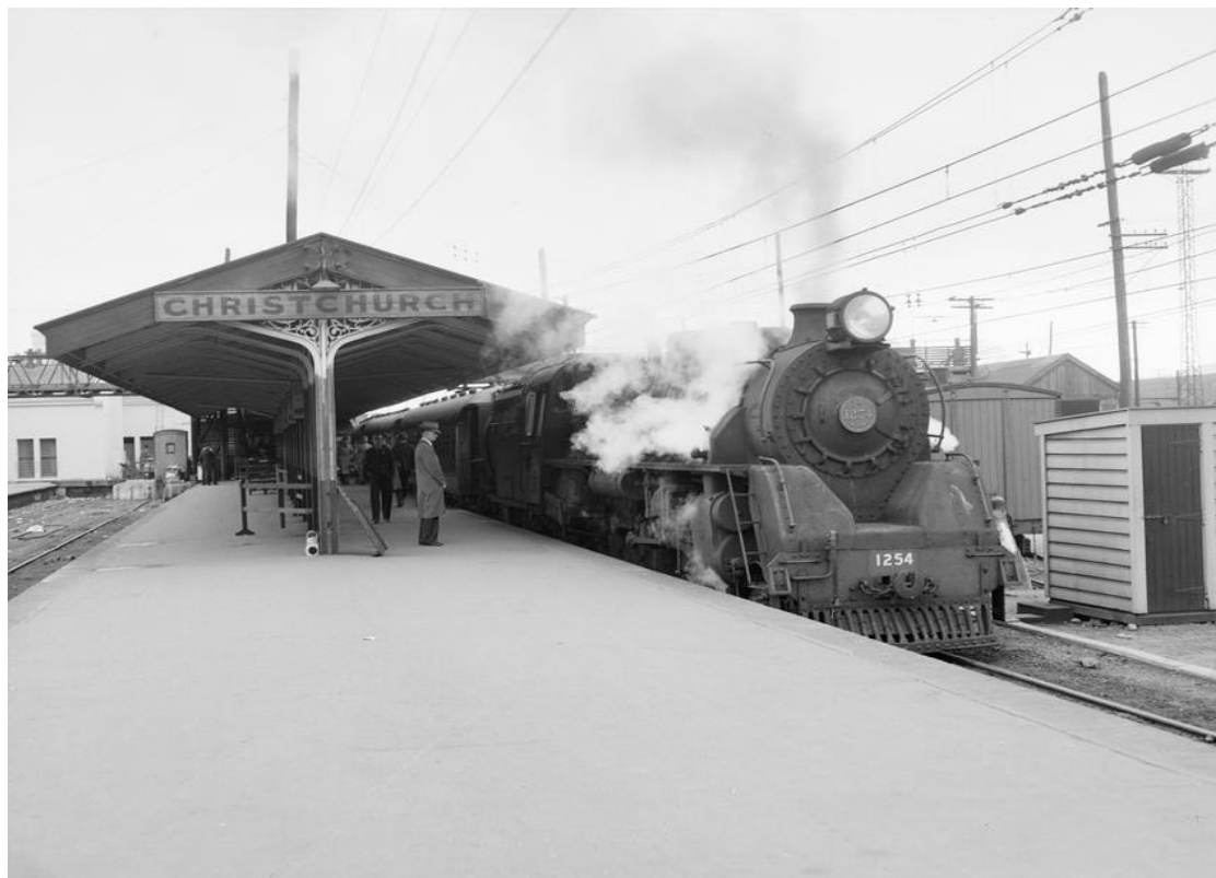
West Coast express awaits departure from Christchurch station early in the morning, 28.03.1950

Operations Group, Christchurch (Railways) Registered Files [Series: 27270]